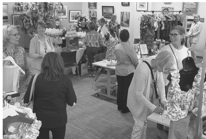
Scranton Shops! 2: 160 Guests Enjoyed an Evening of Shopping and Entertainment

Vendor spaces and sponsorship opportunities are available. For more event information and how to participate as a vendor or sponsor, email: supportscranton@scrantonlibrary.org