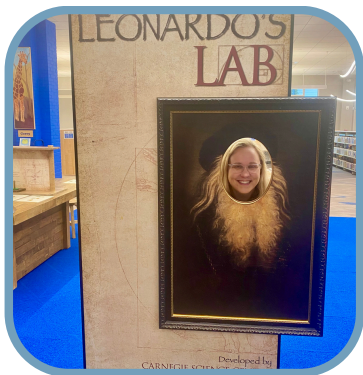
Leonardo's Lab was an educational, interactive museum that opened in January, 2023.

January - We were excited to welcome the Leonardo's Labs museum exhibit to the Children's Room. This fun, educational exhibit was funded by the Schumann Family Foundation and was visiting from the Ithaca ScienCenter in NY.