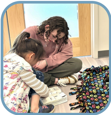
Elementary school children read with high school students at the Book Buds program.

July - Started our first-ever free summer camp for Madison children, sponsored by the Schumann Family Foundation. Held the opening reception for the Katz art collection.