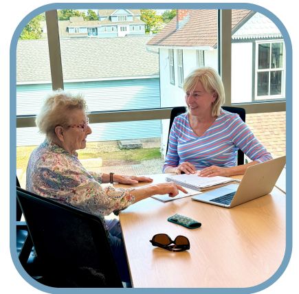
The library recently started offering genealogy sessions.

I benefit immeasurably from our library. I treasure Scranton's dedication to supporting literacy and serving patrons with a rich collection and wonderful service.