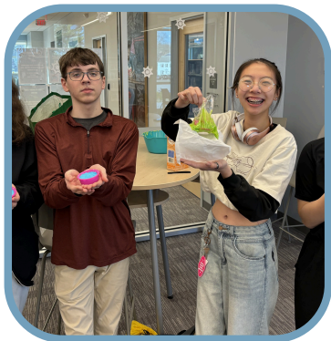
Teens had fun making scented bath bombs.

June - Held the first-ever Summer @ Scranton Block Party with over 500 participants. The Beachside Bash was also a fun way to kick off summer!