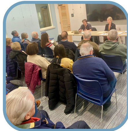
Patrons asked questions to State Government officials at the Town Hall event.

I believe libraries are an essential community resource, critical to preserving democracy, fostering social inclusion, and offering opportunities for learning to all.