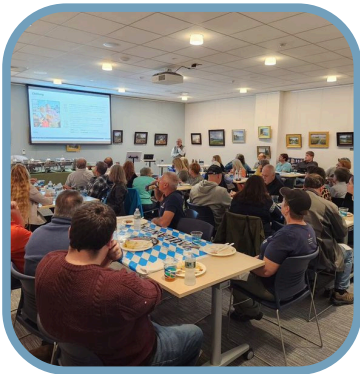
The Johnson Community Room was packed for the Oktoberfest event.