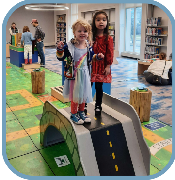
Families enjoyed the Grand Opening of Turtle Travels in January, 2023