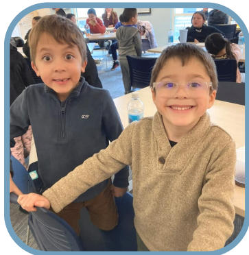
English Learner students learned more about the Scranton Library and other community resources in December, 2023

July - Debuted two new bicycles from our "Library of Things" in the annual Fourth of July parade. The library bikes, available for one week check outs with a Madison library card, have proven very popular!