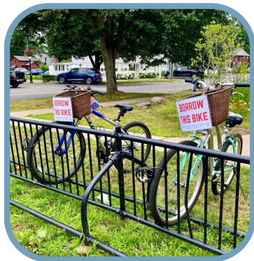
Debuted two new library bikes available for check out from our "Library of Things" in July, 2022