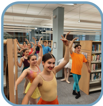
The community gathered for the second annual Celebrate the Arts in June, 2023

January - Welcomed the community to our new Turtle Travels exhibit in the Children's Room. This fun, educational exhibit was funded by the Schumann Family Foundation and was visiting from the Ithaca ScienCenter in NY.