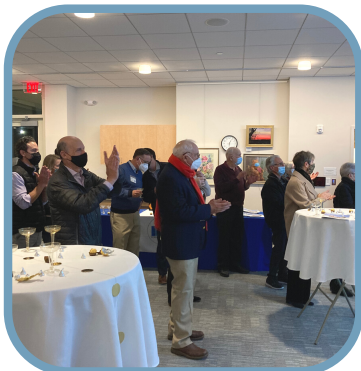
Community supporters raised a glass at our first annual "Toast of the Town." December 2021

July - Handed out 300 copies of New Kid , a book featuring themes of diversity & inclusion; as part of our One Book, One Town program. Over 100 people attended related programming; including facilitated discussions, cartooning workshops, and a chance to meet the award-winning author, Jerry Craft!