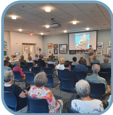
Carl Zimmer spoke about his book, Life's Edge: The Search for What It Means To Be Alive , at a donor thank you event. August 2021