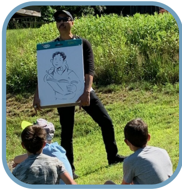
Jerry Craft delighted students at a special outdoor event highlighting his book, artwork, and message of inclusivity. July 2021